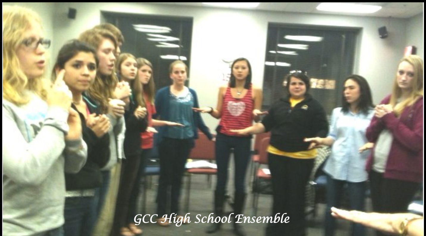
GCC High School Ensemble